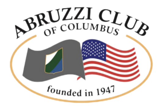
Abruzzi Club Scholarship

The Abruzzi Club, in conjunction with the Catholic Foundation, is offering a scholarship for the 2022-2023 school year. This scholarship is open to any child or grandchild of a current Abruzzi Club member, in good standing, with at least one year of membership. The current scholarship will be $500.00, and will be available to students in the Columbus Diocese school system. Scholarships will be disbursed directly to the school and can be used for any